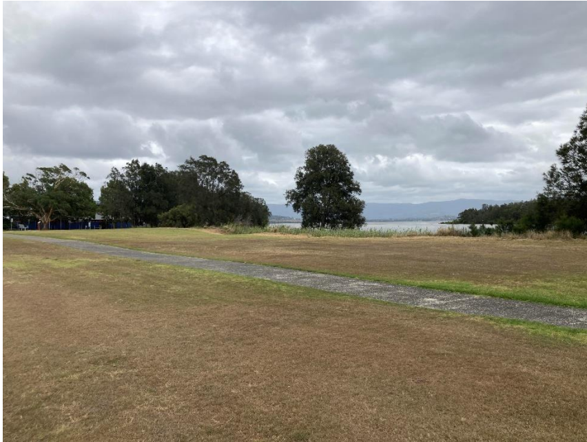
Hooker Park, potential site