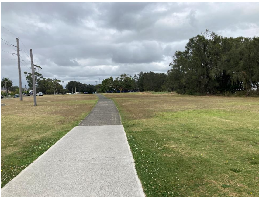
Hooker Park, Western facing view