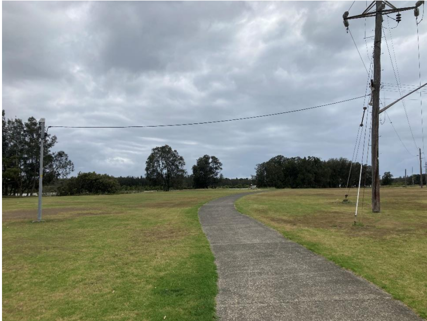
Hooker Park, Eastern facing view