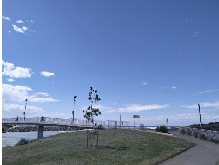
Nearby pedestrian bridge