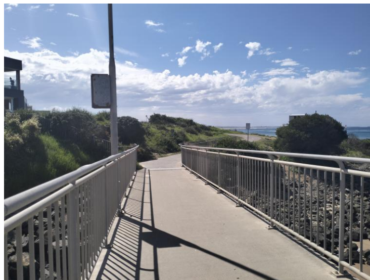
Northern side of pedestrian bridge