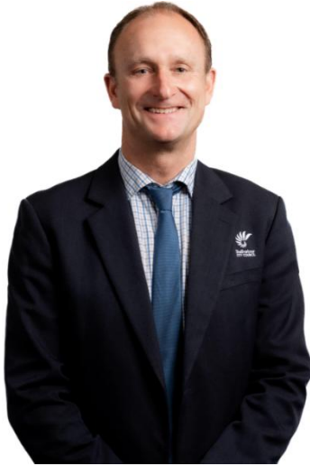
Mayor of Shellharbour Chris Homer

Welcome to Shellharbour City Council's Disability Inclusion Action Plan.