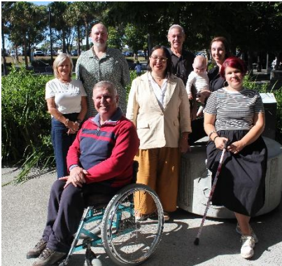
Members of The Committee

The Disability Access and Inclusion Advisory Committee speaks up for people with disability who live, work, or visit Shellharbour City.