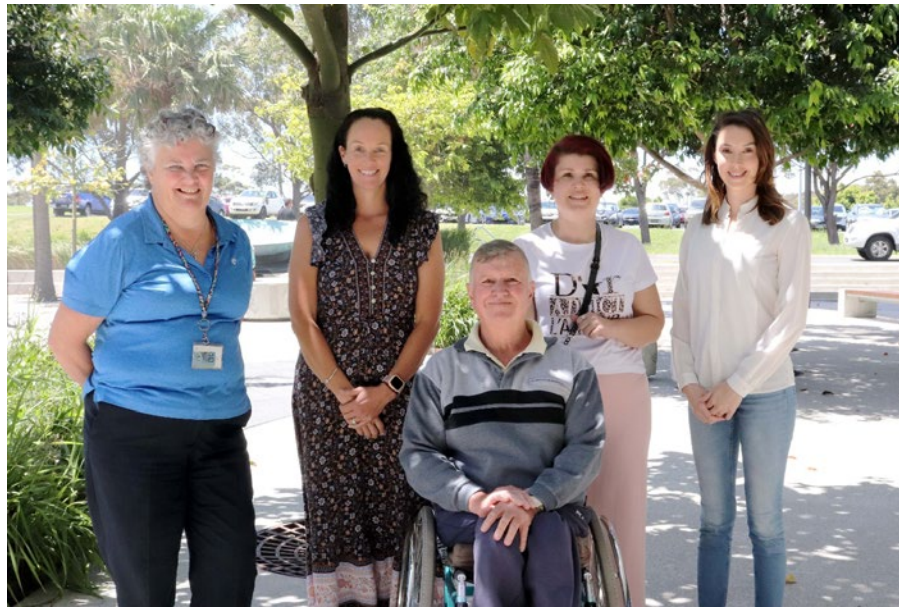
Members of the Shellharbour Disability Access and Inclusion Advisory Committee (DAIAC)

The committee had a critical role in overseeing the development of this plan and will be actively engaged in the implementation and monitoring of the plan.