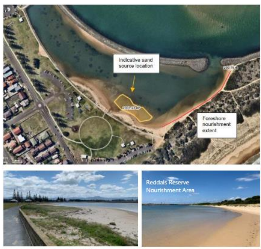
Figure 1 Image from project brief

The sand scaping works has been completed at both Reddall Reserve and Elliot Lake over the month of May. The foreshore edge has had vegetation pruned back and sand deposited, creating a foreshore width of approximately 4 metres. Council maintenance staff are following up regarding the scouring that has occurred already from some recent high tides. This will be reshaped to best suit the area. Council staff will continue to monitor the site.