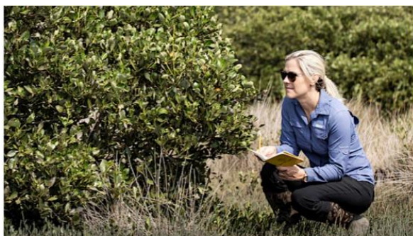
Coastal Ecosystems: Between the Land and Sea