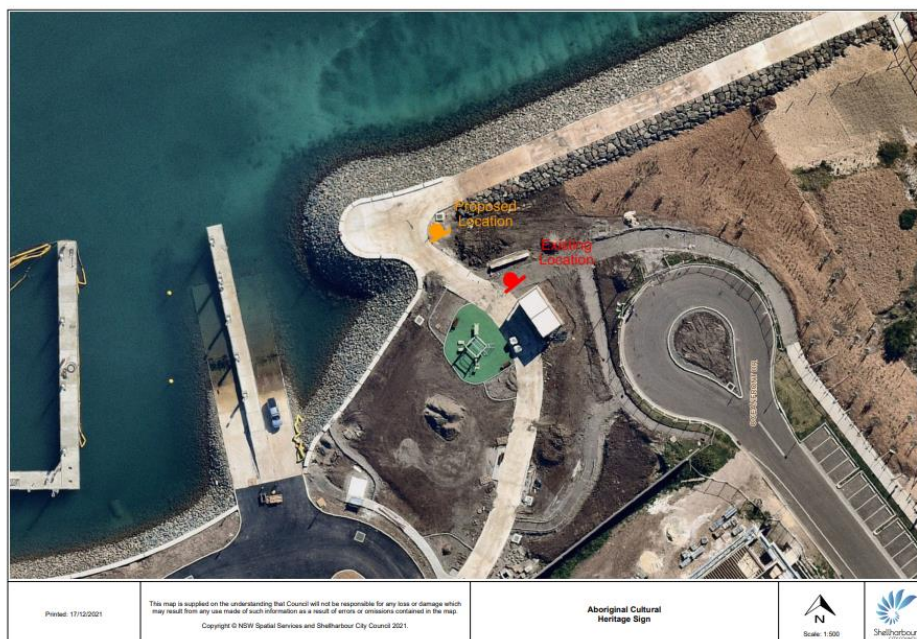
Figure 1. Overview photo of existing and proposed locations of the Aboriginal interpretive sign

Council aim to have the updated skins ordered for manufacture by late April.