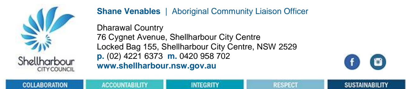
Figure 1 - Draft example of Council's address in staff email blocks

If Council were to implement the inclusion of Traditional Place names as part of our address, the suggestion would be 'Dharawal Country', in line with the place names included in our Cultural Protocols. An example of what that could look like is provided in Figure 1 below.