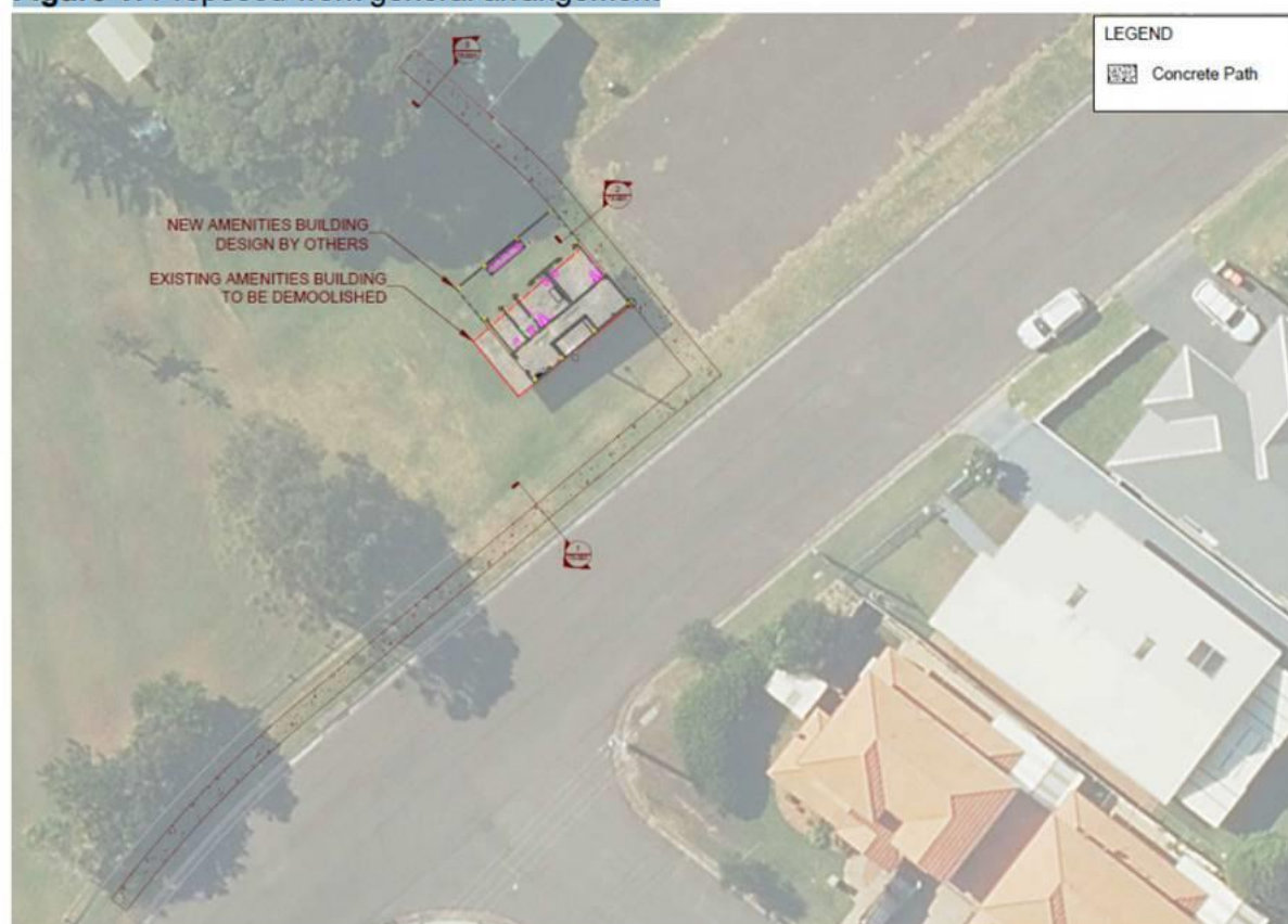
Figure 1: Proposed work general arrangement