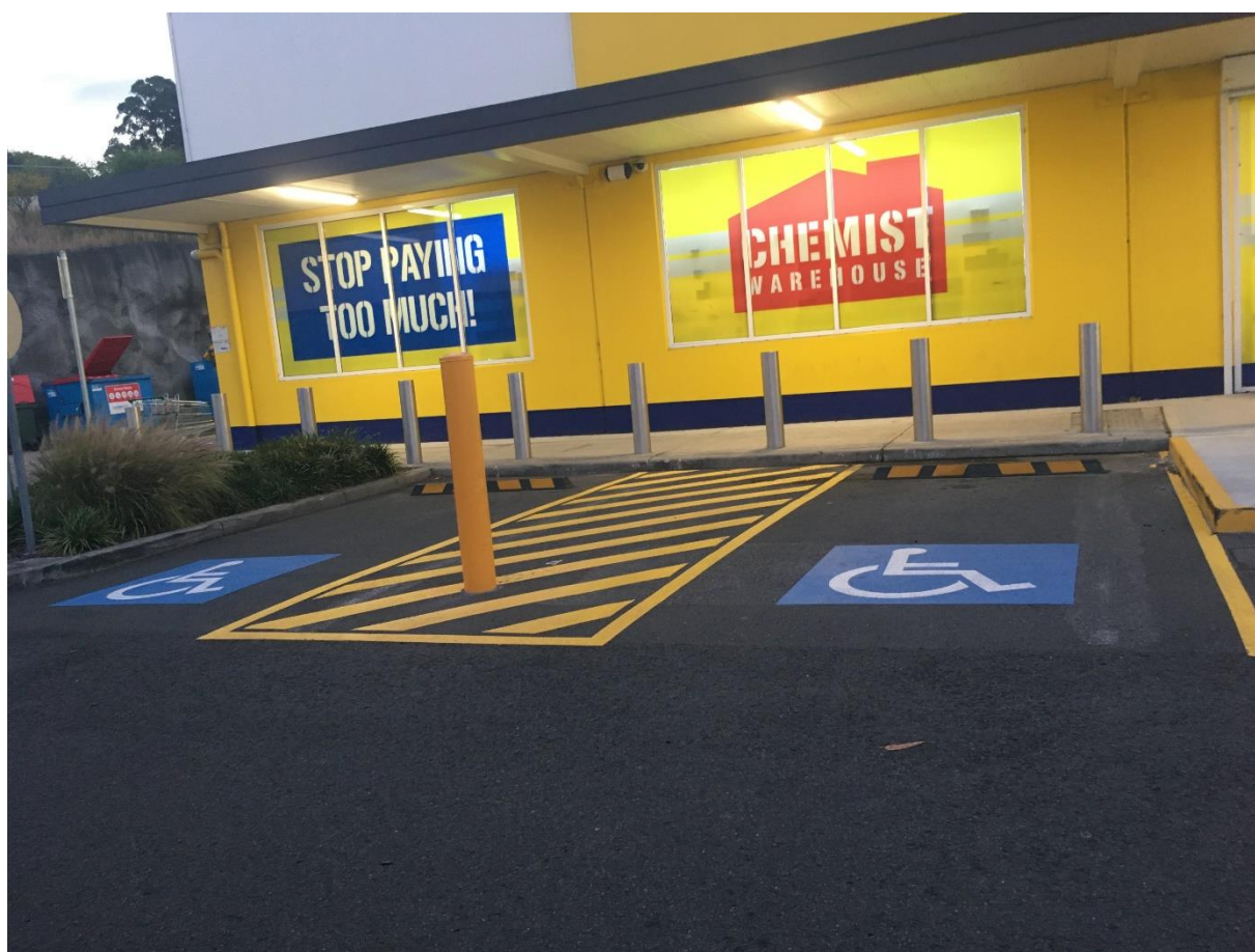
Accessible car parking spaces in front of Chemist Warehouse

The Community Development Officer informed the committee of concerns raised by a visitor to the area regarding the lack of access from the accessible car parking spaces in Range Road, Shellharbour City Centre, in front of the Chemist Warehouse.