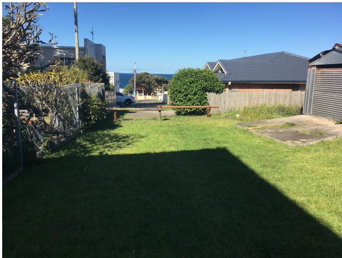
Bollards at grassed area off Wentworth Street looking towards Wollongong Lane