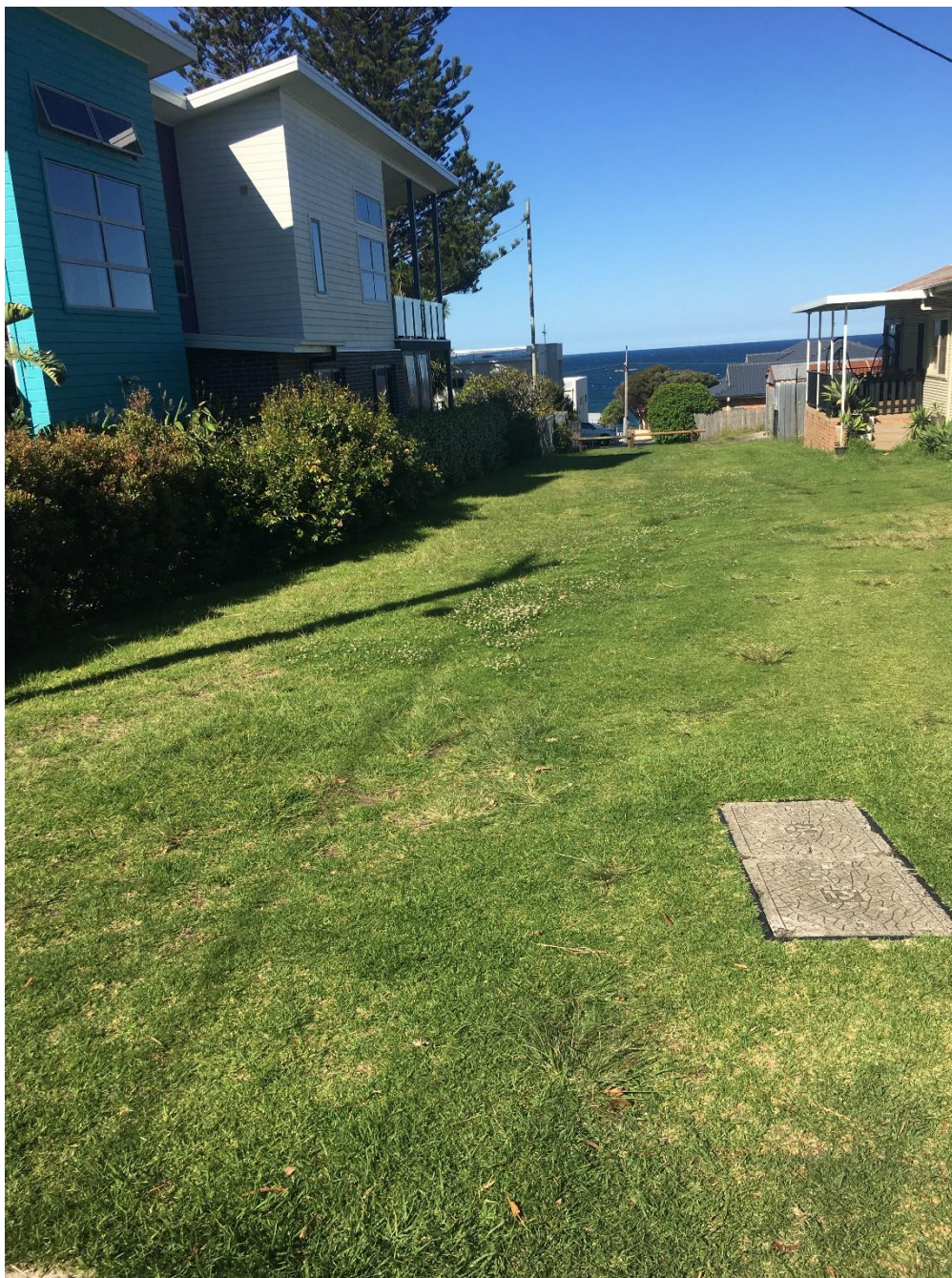
Grassed area off Wentworth Street

Following a question from Cr Moran the Community Development Officer advised that a local resident has contacted Council regarding the inaccessibility of part of Wollongong Lane with a request that Council give consideration in future allocation of infrastructure funding for concreting the remaining part of the lane to make it more accessible for people with disabilities and mobility issues.