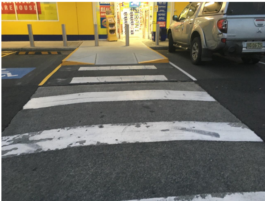
Current path of travel