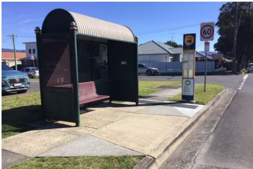
Figure 2: B44 Bus Stop, Oak Flats