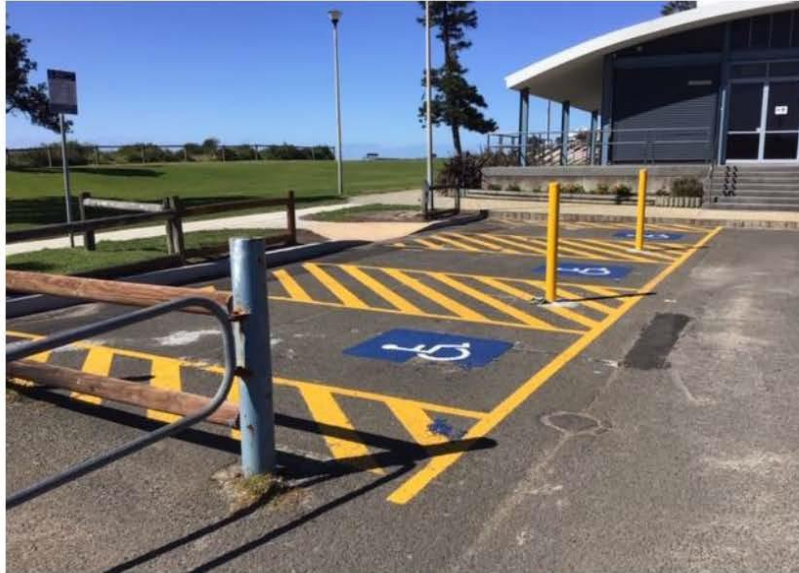
Figure 1: Shellharbour North Beach parking