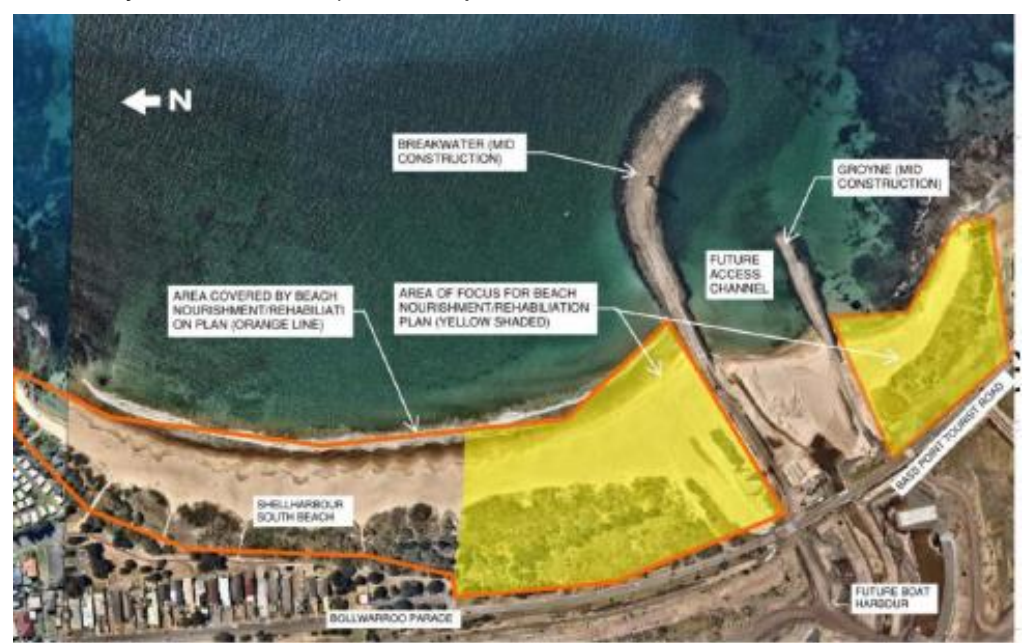
Figure 1 - Shellharbour South Beach extents covered by this Beach Nourishment/Rehabilitation Management Plan

The proposed works are situated within the EPL boundary and need to meet the requirements of both the EPL and the CEMP. Coastwide Civil are responsible for the EPL and understand the requirements of the CEMP. The objectives of the Beach Nourishment and Dune Rehabilitation Plan have been developed to cover both the construction and operational phases of the Shell Cove Boat Harbour development, and to align with those of the broader Shellharbour Coastal Dunes Management Plan (Shellharbour City Council, 2016) and Shellharbour Coastal Zone Management Plan (Shellharbour City Council 2017). A site plan is: