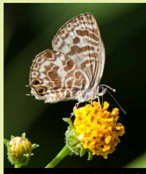
This photo by Vicki Waters shows a Zebra Blue Butterfly sucking up nectar from a flower using its proboscis.

The mouth parts of the butterfly have been lengthened to form a coiled tube called a proboscis for piercing and sucking nectar. Amazingly, butterflies' 'feet' (called tarsi) have a sense similar to taste. When they touch sweet liquids such as nectar with their 'feet' it triggers the proboscis to uncoil.