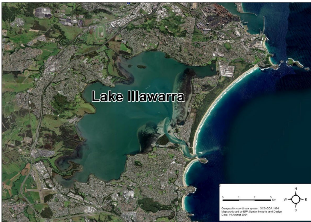
Figure 1 Lake Illawarra, NSW, Australia

Wollongong and Shellharbour local councils are implementing a coastal management program (CMP) for Lake Illawarra to maintain and enhance the quality of the lake and estuaries. The program provides nine strategies to improve water quality in the lake and estuaries, including strategy WQ9: 'Investigate and manage potential pollution sources including contaminated sites that contribute to poor water quality in the lake'.